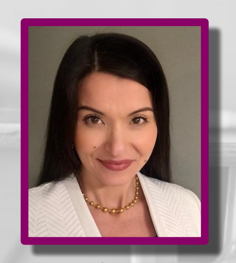
Honesty for Ohio Education